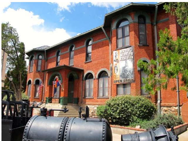
Bisbee Mining and Historical Museum

The Bisbee Mining and Historical Museum that is affiliated with the Smithsonian Institution has excellent exhibits of Bisbee history, minerals, and geology.