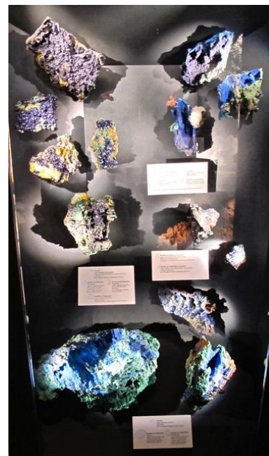
Part of their mineral exhibit