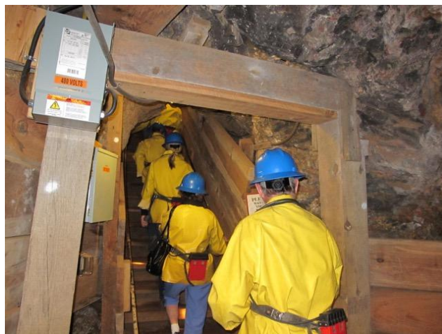
Inside the Queen Mine