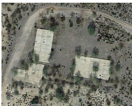
Concrete slabs where the drill rig and buildings were located that is very visible on the Google satellite photographs.

Next month, why spend nine million dollars to drill in granite for oil in southern Arizona?