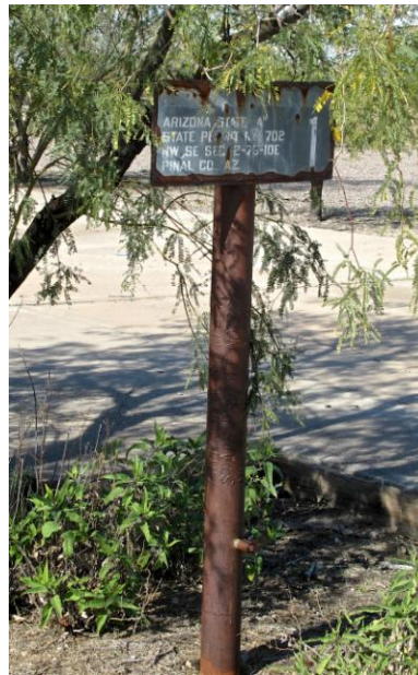
Rusted pipe with a small sign on it surrounded by concrete where the drill rig and buildings were located.