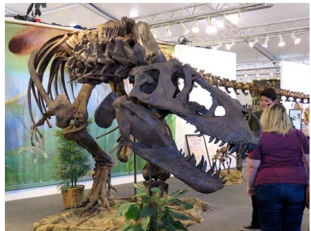
22 nd Street Mineral Fossil & Gem Show

Main Avenue Fossil and Mineral Show (1202 N. Main Ave.): There are many tents with dealers from Morocco with tons of fossils from Morocco. You can buy one small shark's tooth or a giant polished fossil slab. Be sure to bargain here on the price as it is expected. I always buy the fossils for the kids fossil dig and for specimens to sell in the Pinal Geology Museum at this show.