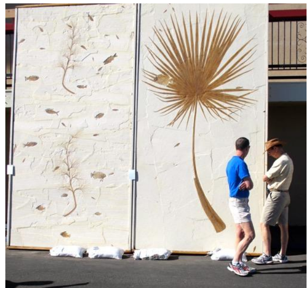
Arizona Mineral & Fossil Show (Ramada Inn)