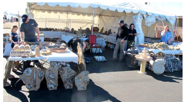
Main Avenue Fossil and Mineral Show