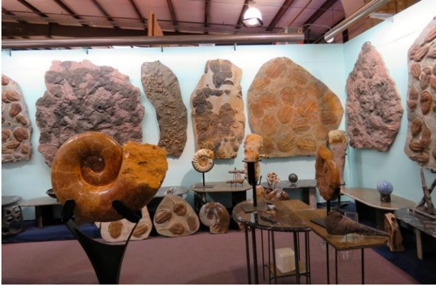
Mineral and Fossil Co-op