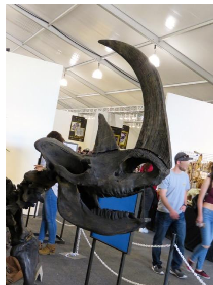
22 nd Street Mineral Fossil & Gem Show