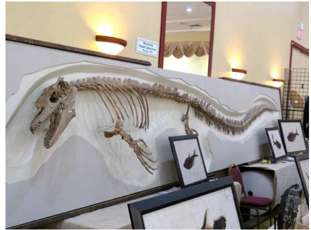
Arizona Mineral and Fossil Show ballroom