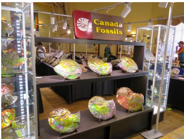
Arizona Mineral and Fossil Show ballroom