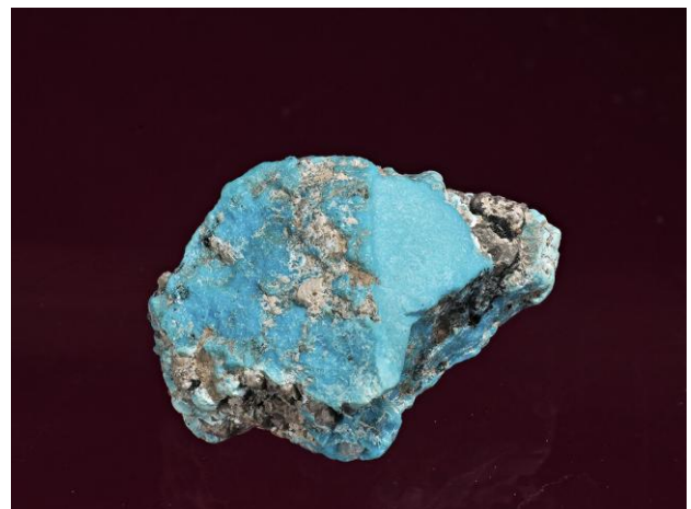
Turquoise, Morenci, AZ