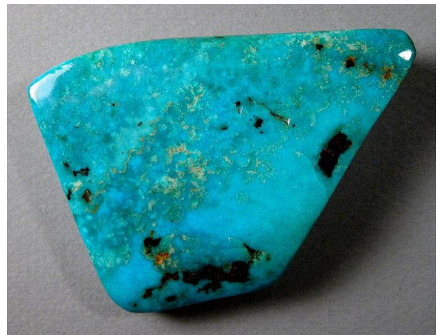
Turquoise, Bisbee, AZ